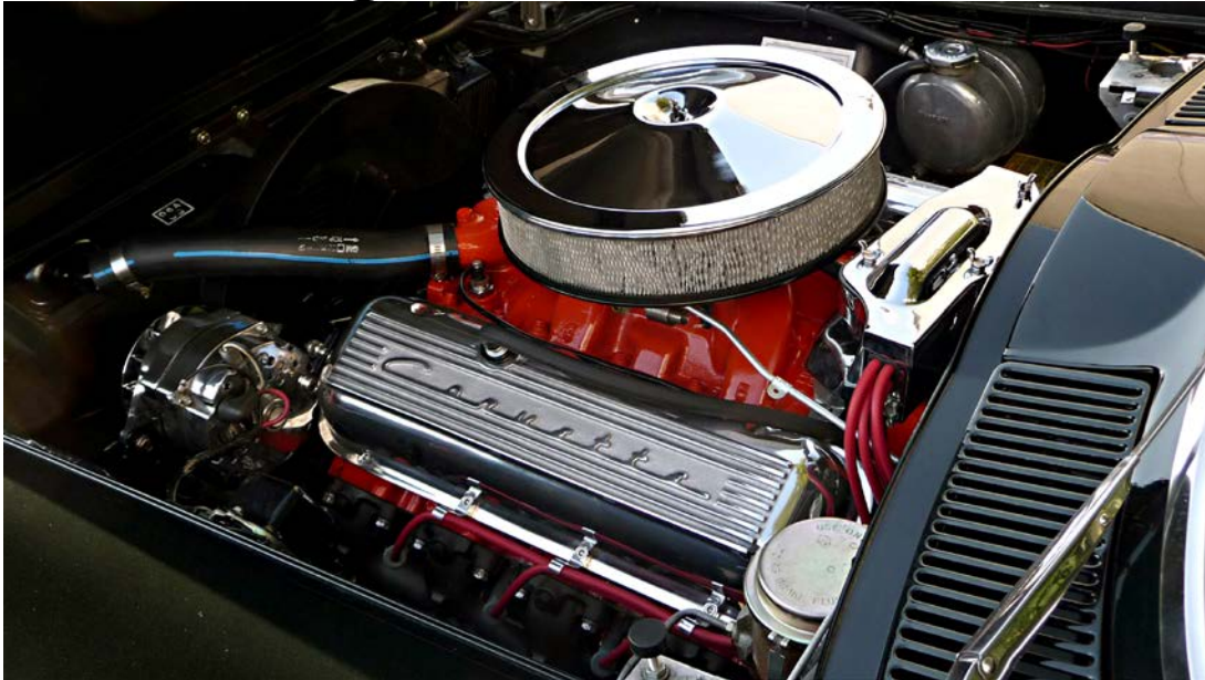
PML valve covers with CORVETTE script and fins, tall height, polish finish, PML part number 11042, installed on a 1965 Corvette, Crane gold roller rockers with stock length studs.