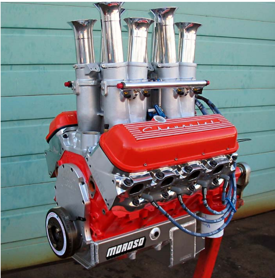
PML valve covers with CHEVROLET scrip and fins, tall height, orange powder coat finish, PML Part Number 9739, installed on a 540 motor.

General Motors Trademarks are used under license to PML, Inc.